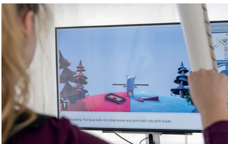
Example task: balance balls into their targets with your arms

VAST.Rehab uses a wide variety of therapeutic tasks to enable training in all rehabilitation domains: