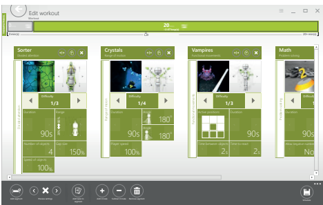
Create specific trainings in the VAST.Rehab software