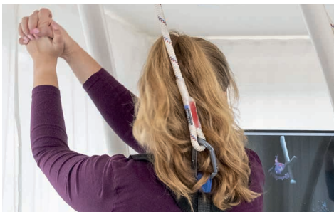
Example task: swing a sword and defend yourself against vampires