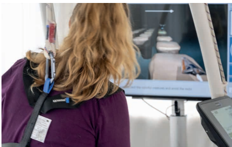
Example task: steer the spaceship via your upper body movement