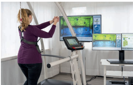
Dual tasking including the upper limbs for a full body workout on a treadmill