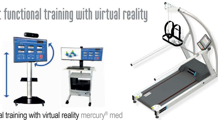
recommended configuration functional training with virtual reality mercury® med